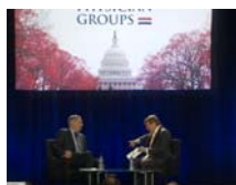
Video from the APG Colloquium

“this type of (middle of the pack) policymaking fails to drive and reward the change we need in our healthcare system. ...Feed the lead dogs... Need to reward the leader”